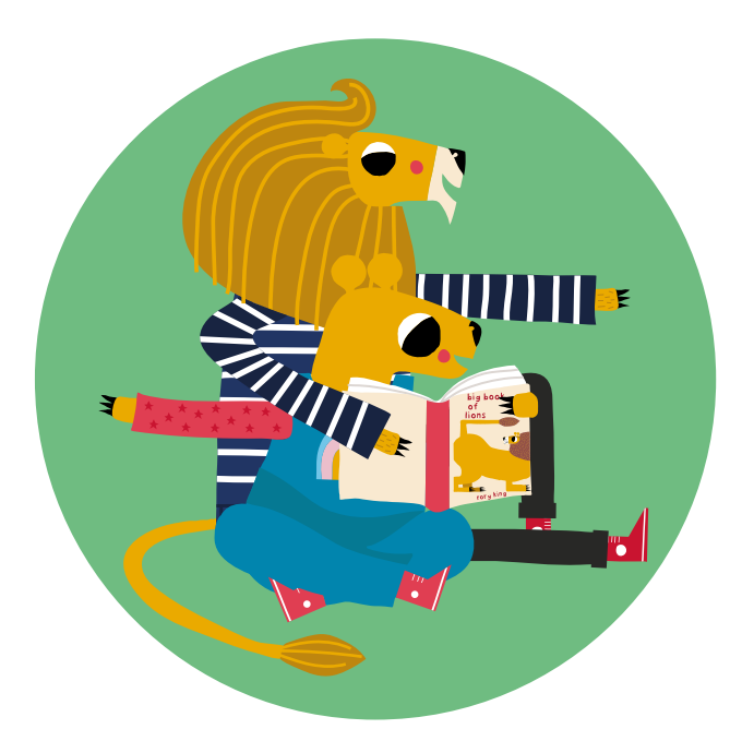
And he says "yes!" to telling stories.

Now, when I ask Dad to play with blocks he says "yes!".